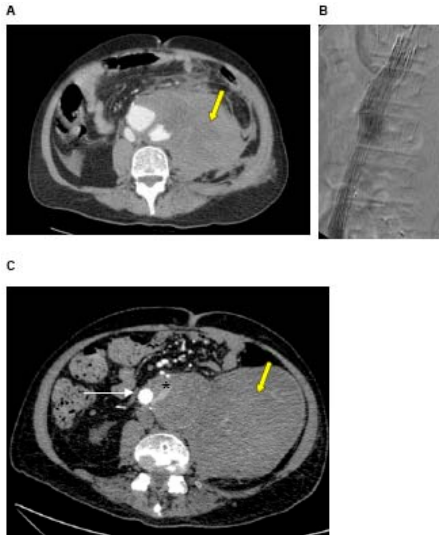
Fig. (2). A: CT of a ruptured AAA in a 72 year old man with a large haematoma (yellow arrow) B: Intra-operative angiogram during urgent EVAR showing stent graft in position, excluding the AAA C: Post-EVAR CT showing stent graft in situ and type II endoleak. Contrast is seen within the sac outside of the stent graft (white arrow = stent graft, * = endoleak), arising from one of the lumbar arteries. The haematoma caused at the time of rupture is still present (yellow arrow).

angioplasty balloon and incorporating intraluminal pressure transducers to monitor sac pressures [97]. At implantation, a segment of native aorta with 2 or more patent side branch vessels (lumbar +/- caudal mesenteric arteries) were reimplanted onto the posterior aspect of the prosthetic aneurysm. Before endovascular exclusion with a PTFE-covered stent graft, pressures within the aneurysm sac closely matched systemic pressures. In models where no side branches were reimplanted, endovascular stenting resulted in significant reduction in sac pressures and no endoleak. In the presence of patent side branches, endovascular stenting resulted in a smaller fall in sac pressures and type II endoleaks were demonstrated on angiography. The side branches remained patent on duplex and magnetic resonance angiography (MRA) throughout the study period of 90 days. This study demonstrated that type II endoleaks resulted in significant sac pressure and if persistent may be of clinical significance. However, the main limitation of this study was the use of relatively nonexpansile prosthetic material to create aneurysms which were unlikely to simulate post-stenting aneurysms.